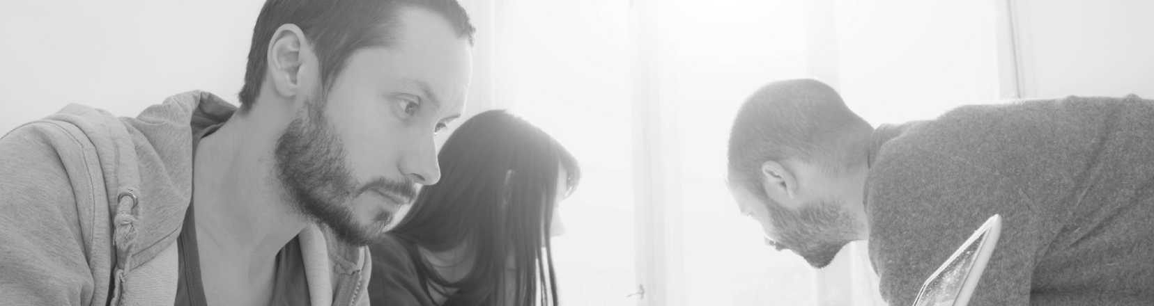
FIGURE 1: AN EXPANDED CONCEPTION OF LEARNING

Figure 1 illustrates examples of informal learning activities in this broadened conception of learning. This conception includes a vast array of learning opportunities that commonly occur but would not be included in a traditional conception of learning.